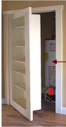
Left Hand Outswing shown