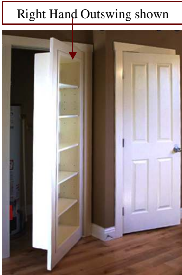
Right Hand Outswing shown