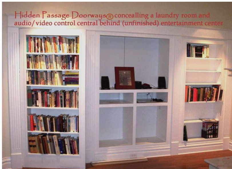
Hidden Passage Doorways® concealing a laundry room and audio/video control central behind (unfinished) entertainment center